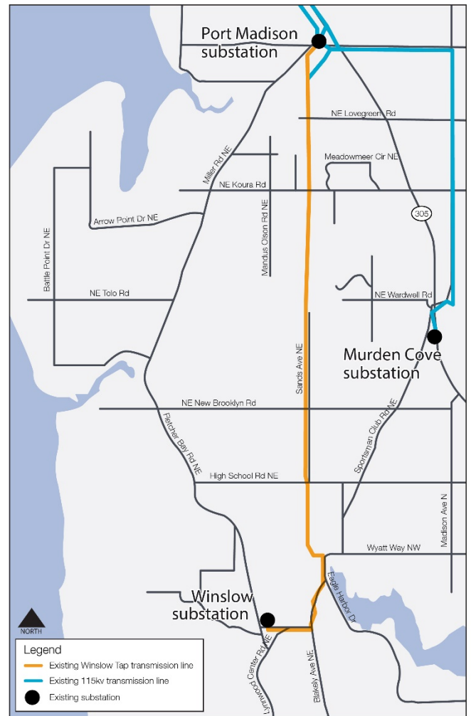
Winslow Tap 115 kV transmission line Bainbridge Island