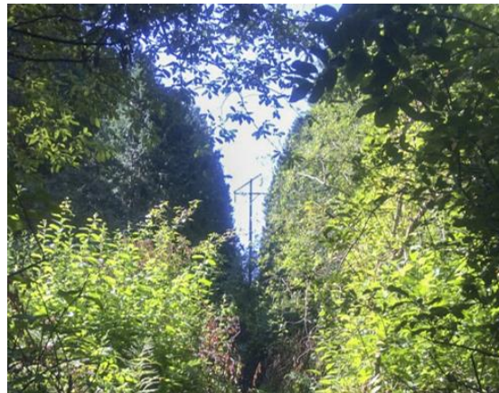
Pictured: Vegetation in the Winslow Tap corridor.

By rebuilding the line and improving safety and access along the corridor, we will reduce the number and duration of outages, serving customers reliably into the future.