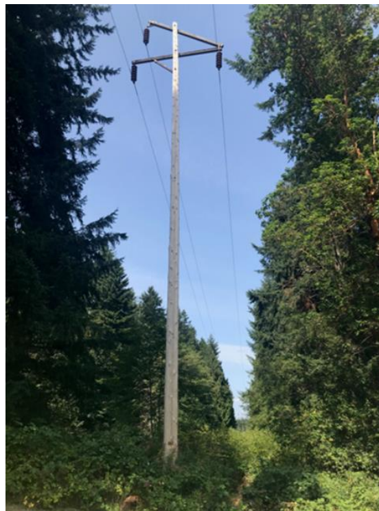
Pictured: The existing Winslow Tap corridor, which has 1960-era equipment nearing the end of its useful life that needs to be replaced.